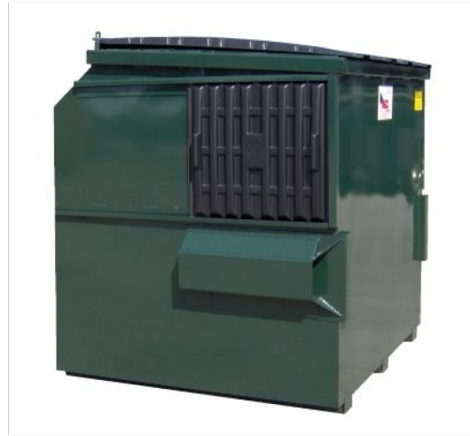
Six, eight, and ten cubic yard Hi-Side