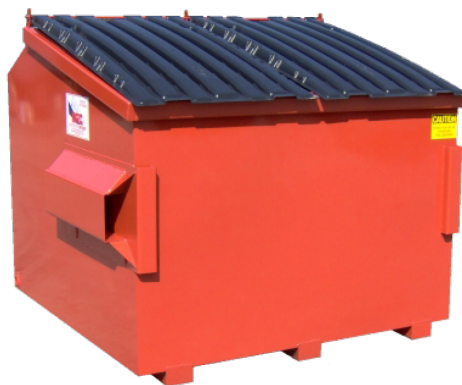
Six and eight cubic yard slant style

Contact: sales@crarent.com service@crarent.com