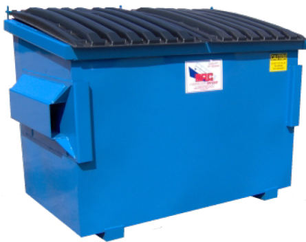
Two, three, and four cubic yard style

Available in two through ten cubic yard capacities, MAC front load containers are constructed of quality AISI grade steel and designed for years of rugged dependable service. Each container meets or exceeds all industry standards and carries a full one year warranty.